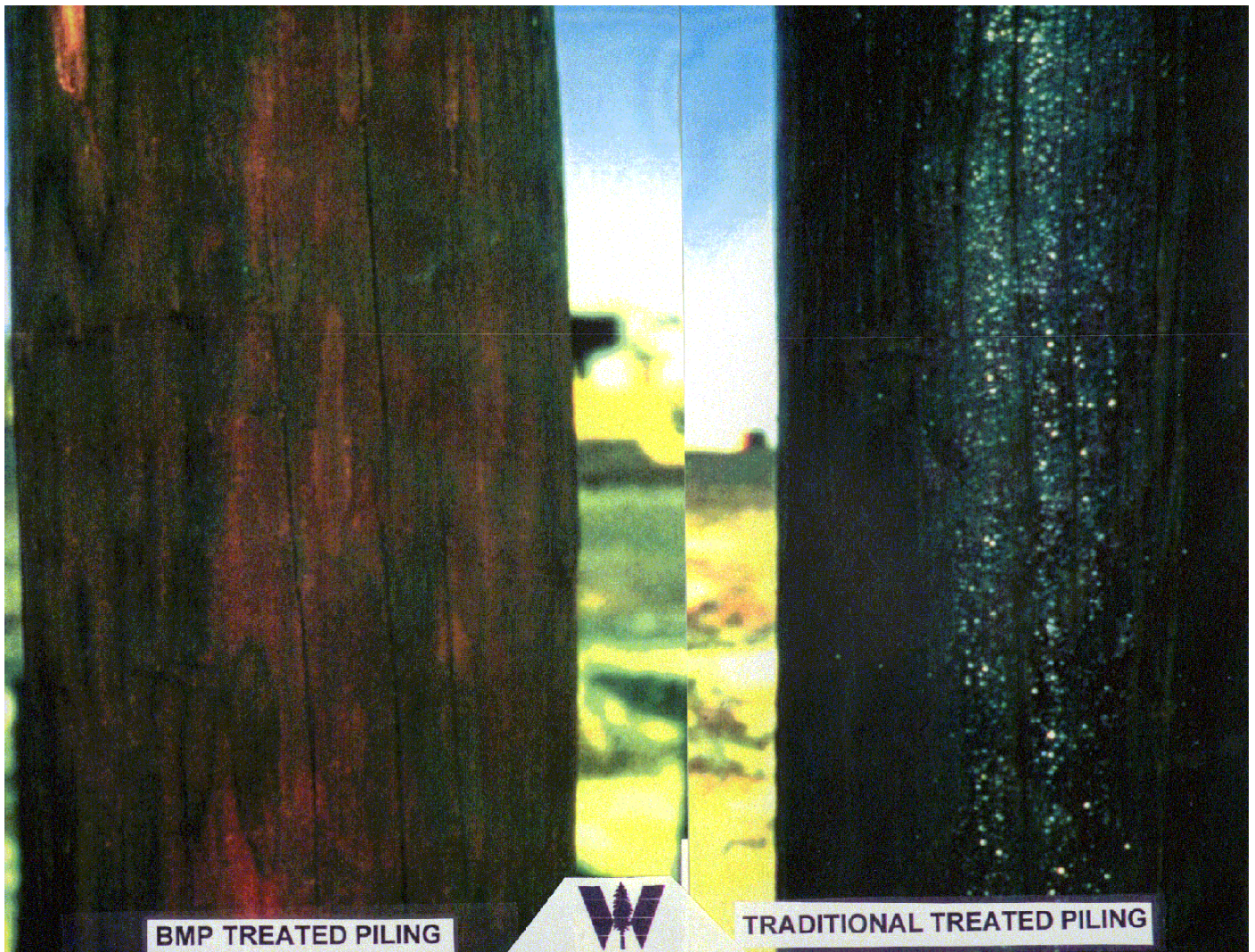
Fig. 2. A new pile treated with creosote to BMP standards, prior to weathering, compared to a pile treated to traditional standards. Note the obvious residual surface creosote on the pile receiving the traditional treatment.

creosote employing techniques to minimize residual pesticide on the surface of the treated product. This can result in significantly less surface residue of creosote on the newly treated wood than was the case with historical treatment methods (see Figure 2). The BMPs recommend treatment to CSA requirements which are linked to the minimum amount of pesticide required to preserve the wood, based on the intended use or exposure (i.e., ground contact, marine use). A number of new in-plant treatment processes including surface residue recovery of creosote are now routinely being used in B.C.