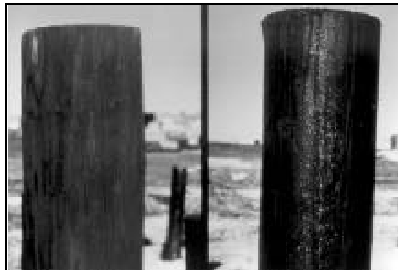
BMP treated piling, left; Traditional treated piling, right

Detailed design and cost estimates were developed for two alternatives: Treated Wood and Concrete. While concrete shared many of the problems of the other alternatives, and trimming to proper heights and connecting to the other materials offered special challenges, it was considered the most appropriate next to wood. The results of the comparison showed that the treated wood design could be constructed at almost 50% less than the concrete alternative.