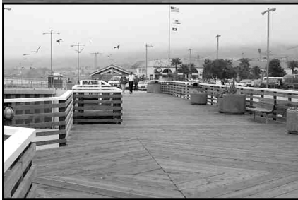
Over 80 pressure treated timber piles support the promenade.

What is 330 feet long, varies 12 to 18 feet in width, and is made up of over 99,000 board feet of treated lumber and piling? The Pismo Beach Promenade.