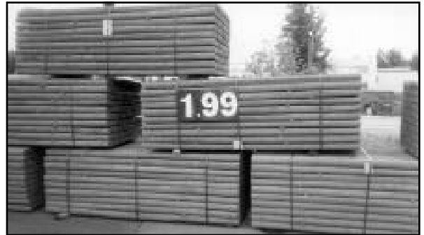
What appears to be a bargain could be a costly mistake.

Treated wood products are somewhat more expensive than their imitations, however as in most everything, there is no substitute for quality. Value is measured in many different ways. In the long run, quality pressure-treated products prove to be the real bargain.